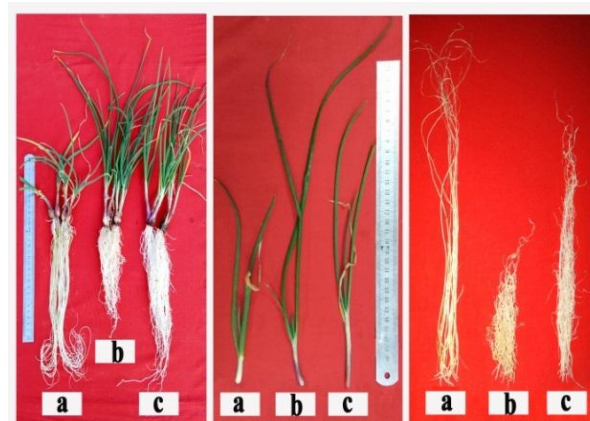
Figure 2. Onion plants growth morphology with close view of leaves and roots in outdoor hydroponics using different supporting media. Here, (a) growth in polystyrene bed, (b) in sands, and (c) in gravels.