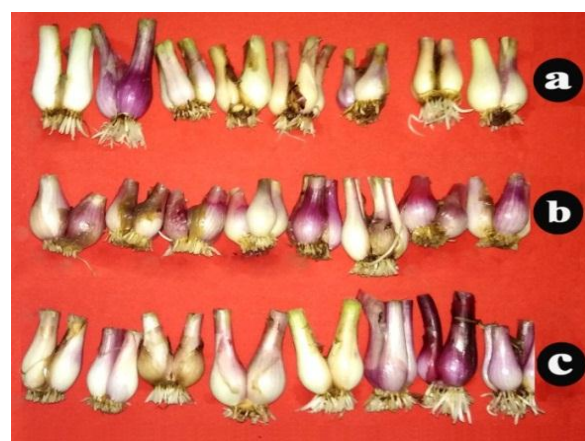
Figure 3. Produced onion bulb in outdoor hydroponics using different supporting media. Here, (a) Onions grown in polystyrene bed, (b) in sands, and (c) in gravels.